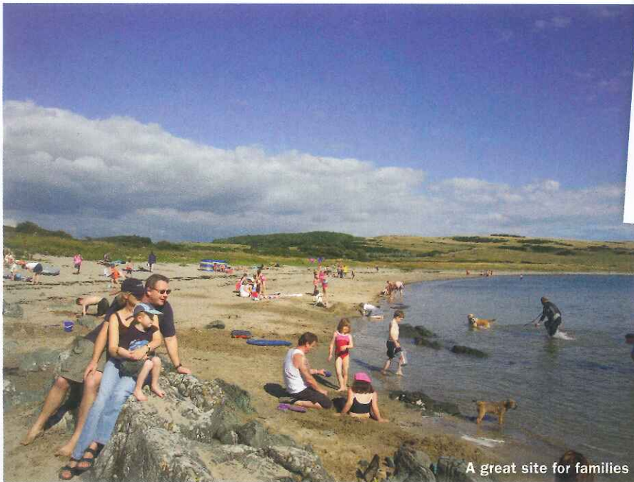
A great site for families