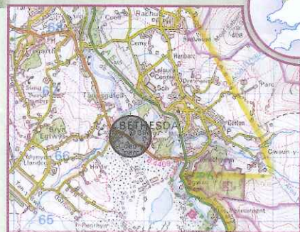
© Crown copyright 2016 Ordnance Survey. Media 023/16