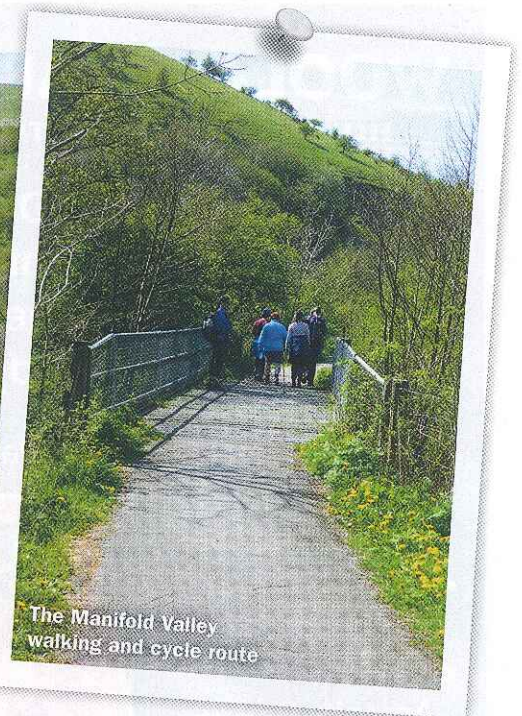
The Manifold Valley walking and cycle route