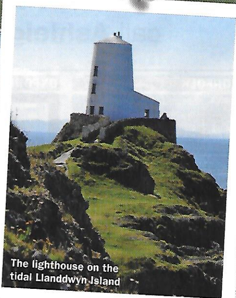
The lighthouse on the tidal Llanddwyn Island