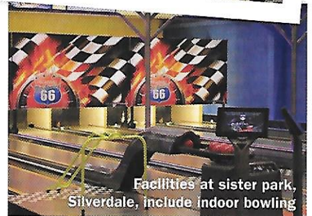
Facilities at sister park, Silverdale, include indoor bowling