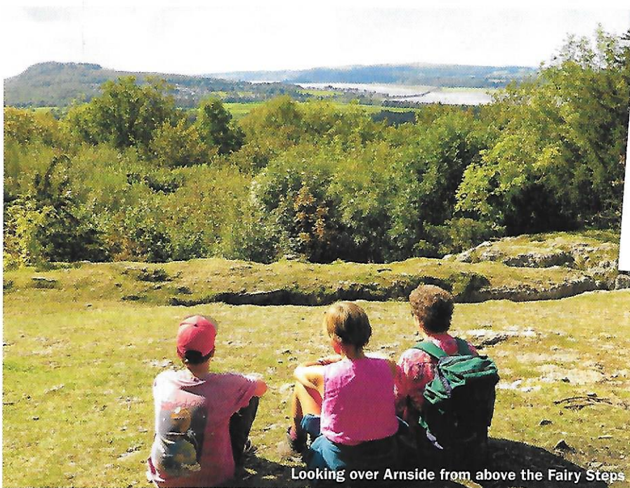
Looking over Arnside from above the Fairy Steps